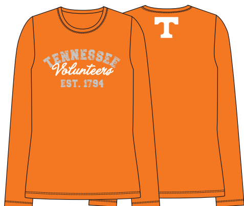
33312-2986 Tennessee Foil Print Tee