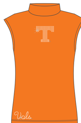
33312-2988 Tennessee Cap Sleeve Tee