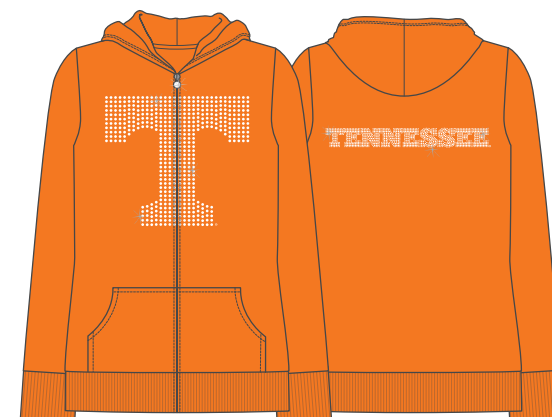
33314-2413 Tennessee Rhinestone Logo Hoodie