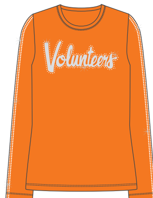
33312-2983 Tennessee Lurex Team Tee