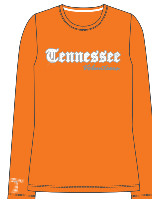
33312-2984 Tennessee Old English Tee