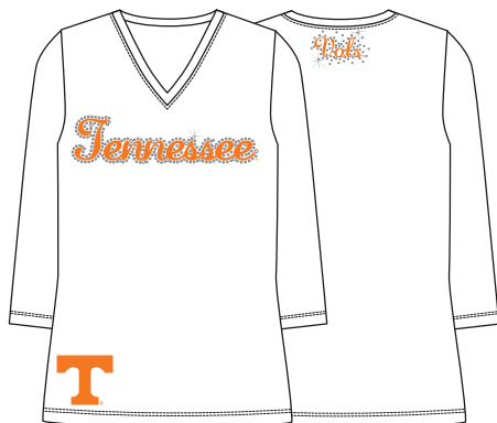
33312-2409 Tennessee Rhinestone Outline Tee