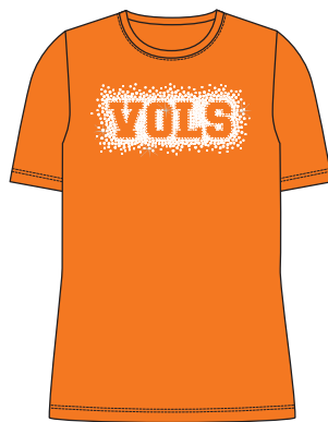
33312-2979 Tennessee Reverse Rhinestone Tee