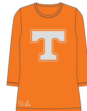
33312-2985 Tennessee Sequin Logo Tee