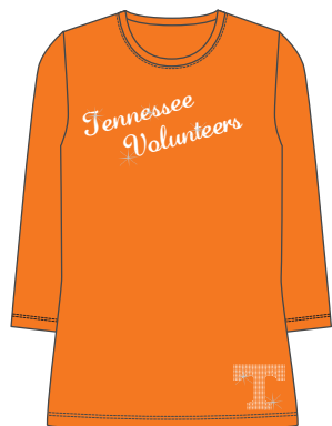
33312-2981 Tennessee Tilted Script Tee