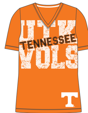
33312-2980 Tennessee Printed School Tee