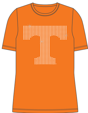
33312-2978 Tennessee Bling Logo Tee